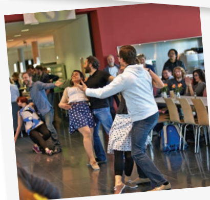
Members of EMBL Heidelberg's Swing Club hit the canteen for a dance 'flash mob'