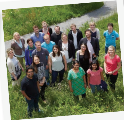
Young scientists from institutes in the Nordic EMBL Partnership for Molecular Medicine visit Heidelberg